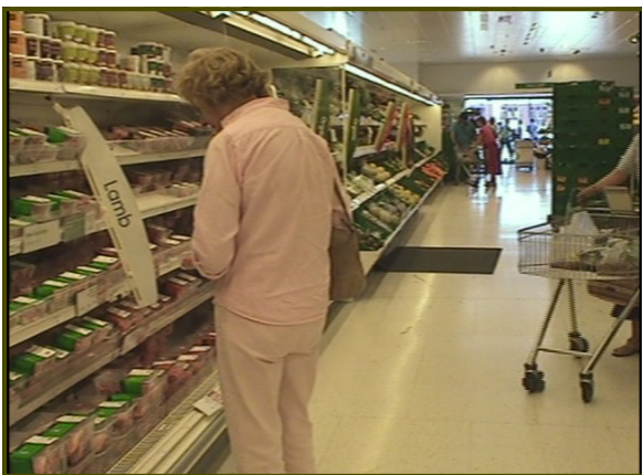
Consumer purchasing lamb at Waitrose

Waitrose proved its commitment to the scheme, borne from producers' commitment to quality and consistency, when it continued to pay prices well above the norm through the collapse of the open market for lamb due to BSE in 1996 and, more recently, the Foot and Mouth outbreaks of 2001 and 2007.